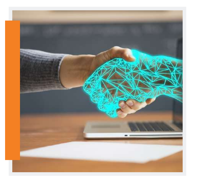
Global Business Essentials & Trends